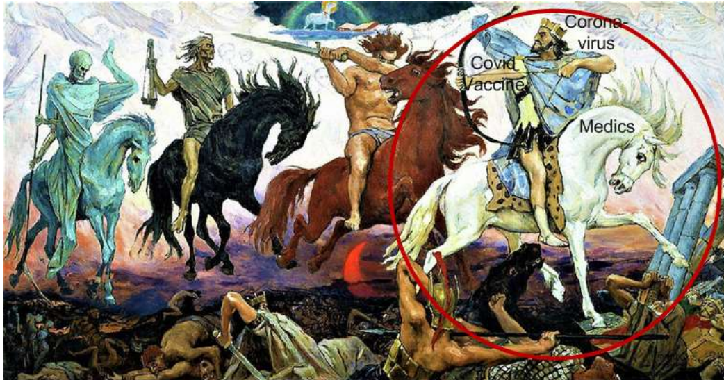
Fig. 1. The White Horse and the Experimental Vaccine

"And I saw, and behold a white horse: and he that sat on him had a bow; and a crown was given unto him: and he went forth conquering, and to conquer." - Revelation 6: 2