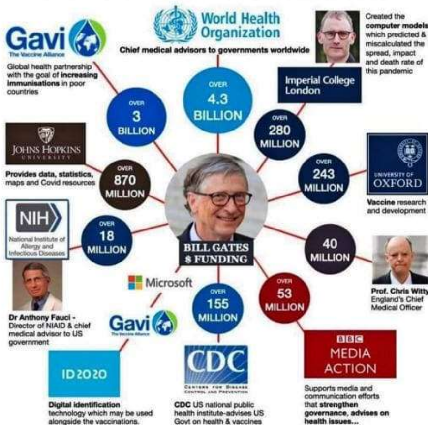
Fig. 4. Bill Gates, a Man of Great Influence

As I have always said to myself: The experimental vaccine is a time bomb, a time-delay bomb. The adverse effects manifest themselves sooner in some and slower in others. What is clear is that the components of the vaccines travel through the body in the blood and will eventually reach, and contaminate, all the organs of the body including the brain in about 3 years. When this happens there will be disease and death and insanity in the vaccinated. Insanity because their brain has become dysfunctional.