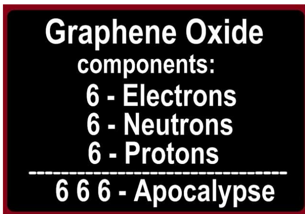
Fig. 5. Graphene Oxide and the Mark of the Beast

If people do not resist this manipulation, they are going to get the full implementation of 5G (which creates flu-like symptoms and kills bees showing damage to the ecosystem) and induced Climate Change. Covid and 5G are intertwined. According to the Elites, there are too many of us on the planet and they are in a hurry to implement their depopulation program, that's why they make so many mistakes. The Horseman of the White Horse, the first rider, is rushing out to conquer the body and soul of the human being with transhumanism, the human being half biological and half machine with the nanochip in the forehead or in the right hand with the number of bars that has 6 at the beginning, 6 in the middle and 6 at the end, 666.